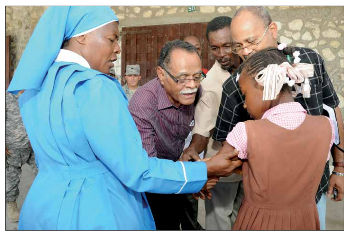
Haiti's Minister of Health looks at rash on young Haitian girl during U.S. Army Medical Readiness Training Exercise in Coteaux, Haiti, April 2010

environment. Given the continued importance of whole-of-government approaches during all phases of joint operations, there may be substantial value in joint force sponsorship of an implementation plan on interorganizational cooperation across the U.S. Government to identify gaps and highlight the potential benefits of sustained unity of effort across the spectrum of operations.