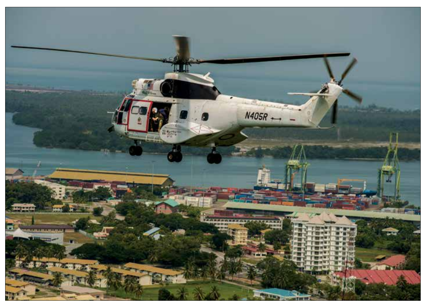
Helicopter assigned to USNS Matthew Perry (T-AKE-9) transports personnel to medical exchange during Association of Southeast Asian Nations Humanitarian Assistance/Disaster Relief and Military Medicine Exercise, hosted by Brunei, June 2013

drawbacks. Lengthy planning cycles, a bureaucratic vetting and staffing process, and a strong institutional cultural bias toward action may be reasons that civilian leaders employ non-DOD organizations with security-like capabilities but without doctrine-based constraints. However, the joint doctrine development process is consciously designed to be adaptable. It provides the means to develop and promulgate new joint doctrine within 1 year, and in the case of existing joint doctrine, urgent change recommendations can be incorporated and promulgated in a significantly shorter time frame.