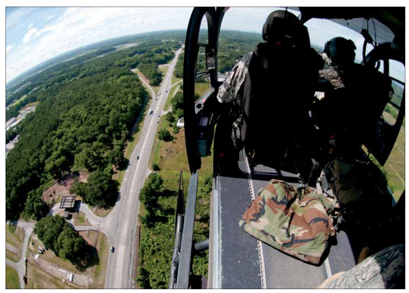
South Carolina Army National Guard pilots fly over major hurricane escape routes near Beaufort, June 10, 2015, during hurricane evacuation exercise

directive (PD)—is solidified, civilian organizations have four other recommended opportunities within the 17.5-month development stage to provide perspectives: first draft comments, first draft working group, final draft comments, and final draft working group.