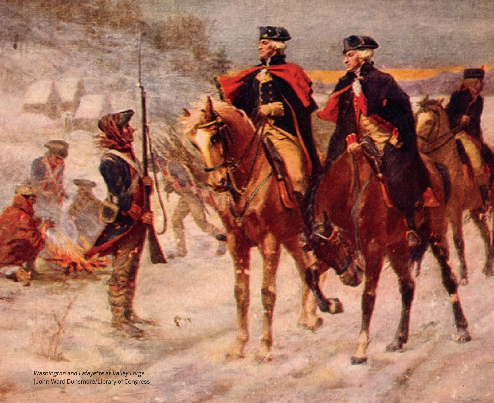
Washington and Lafayette at Valley Forge (John Ward Dunsmore)