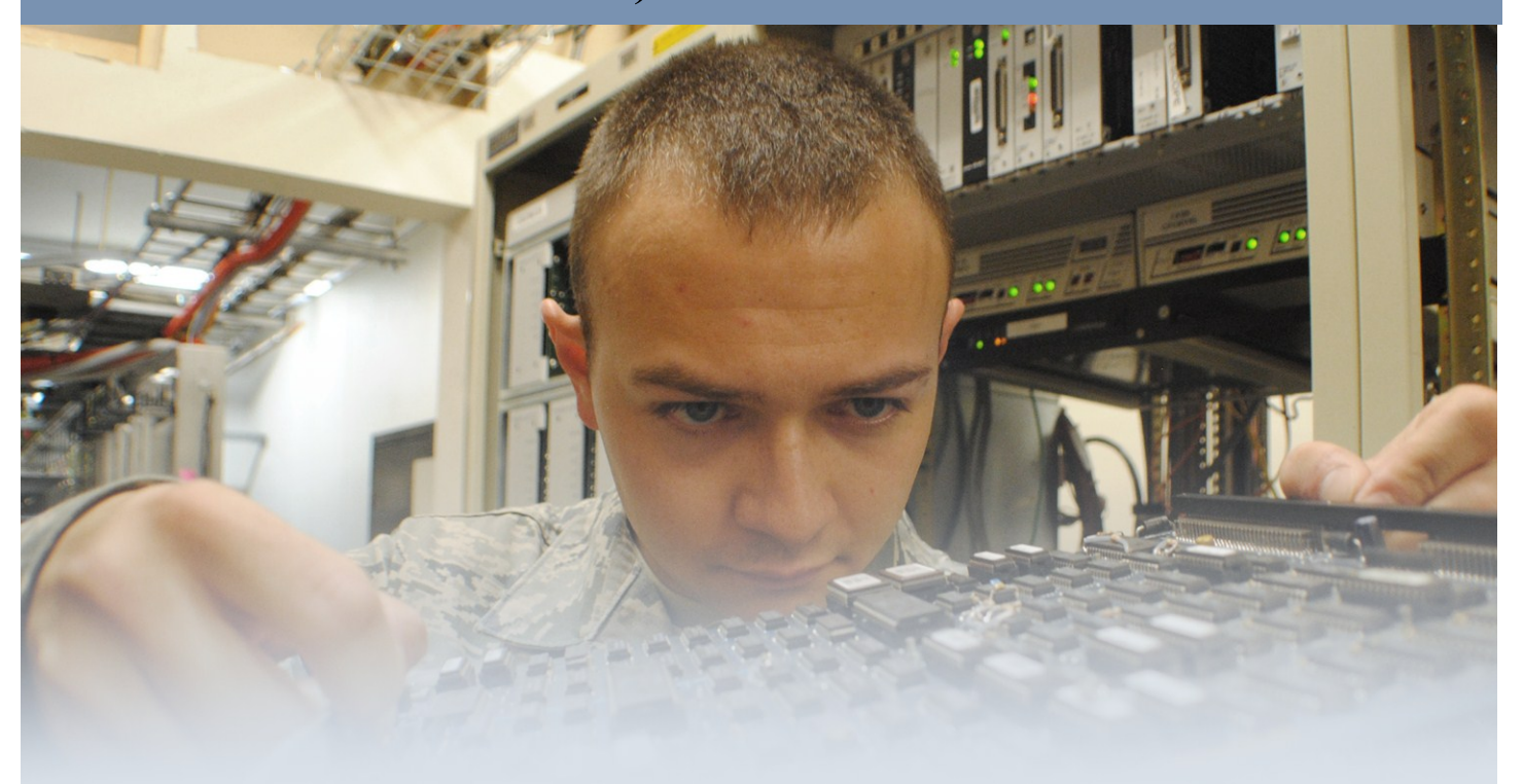
"The secret of change is to focus all of your energy, not on fighting the old, but on building the new."