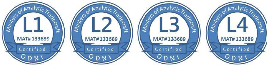
Figure 2. Proposed MAT Rating Badges (as conceptualized by the author)

Evaluations and MAT certifications of analytical rigor will be a unique capability of certified MAT analysts. Only certified MAT analysts will be empowered to evaluate and certify intelligence products. The following analysis will determine if an AIS sponsored schoolhouse, certified MAT analysts, certified intelligence products would or would not increase adherence to ICD 203 standards and improve the culture of analytical rigor across IC.