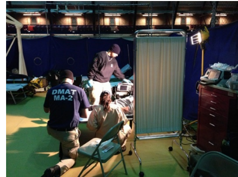
Figure 3: DMAT providing patient care